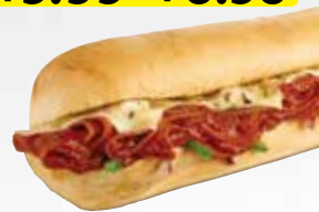
Pizza Sub Melt