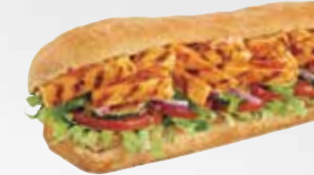
Sweet Onion Chicken Teriyaki