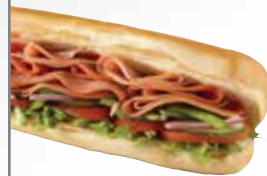
Cold Cut Combo