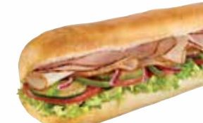
Turkey Breast & Ham