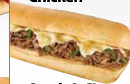
Steak & Cheese