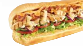
Chicken & Bacon Ranch Melt