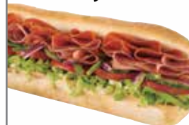
Italian B.M.T.® Pepperoni, Genoa Salami & Ham