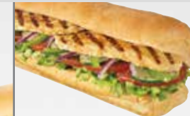
Oven Roasted Chicken